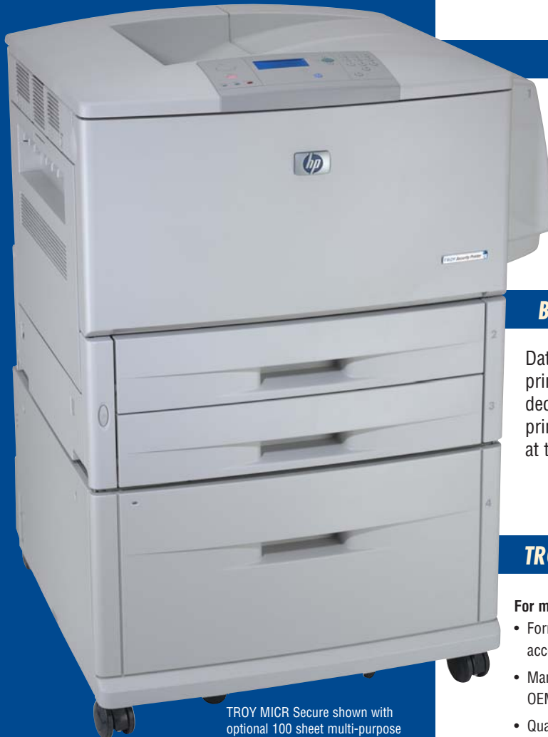
TROY MICR Secure shown with optional 100 sheet multi-purpose tray and 2,000 sheet input tray.