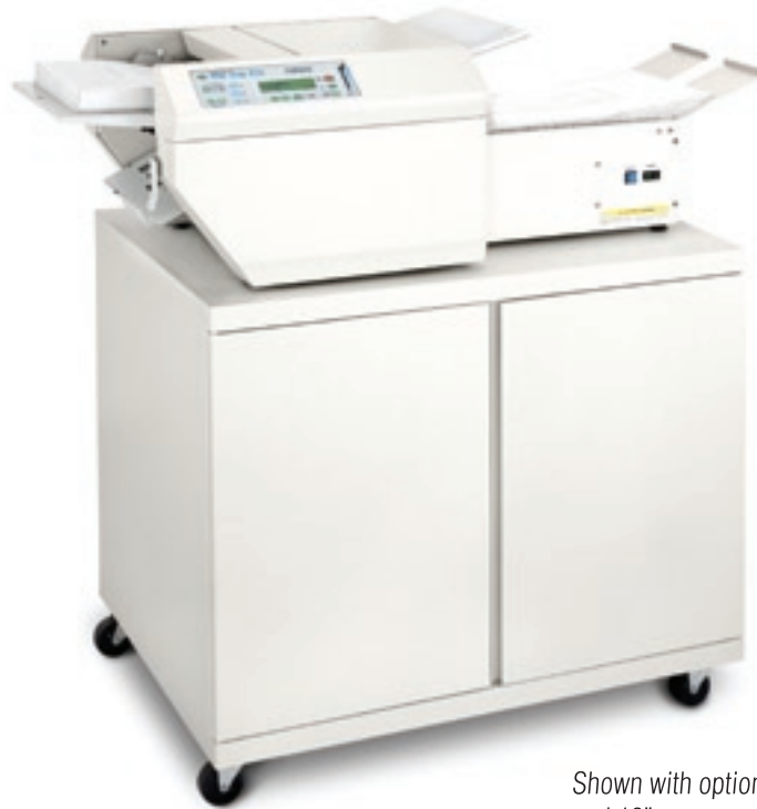
Shown with optional Cabinet and 18" conveyor

The AutoSeal ® FD 2052 is a fully automatic folder/sealer providing the ultimate solution for processing pressure sensitive self-mailers. Designed with ease of operation and efficiency in mind, the FD 2052 automatically detects and adjusts for 11" and 14" (Int'l Size A4) paper sizes and is pre-programmed for three popular folds "Z", "C" and half. The FD 2052 also has the ability to store up to 9 custom fold settings with the simple touch of a button. Up to 350 forms can be loaded in the hopper and processed at speeds up to 11,000 per hour. These features combined make the FD 2052 an ideal solution for streamlining your post processing. The FD 2052 also comes with an optional fully enclosed cabinet for storage and an 18" (46cm) or 4' (122cm) high capacity conveyor with a photo eye for neat and sequential stacking of processed forms.