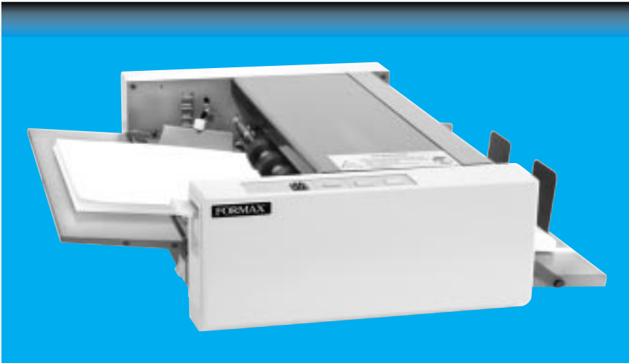
Operator Friendly Control Panel Operator Friendly Control Panel