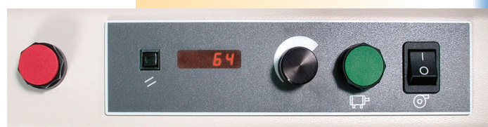
Folder Control Panel

Both units are equipped with interlocks for fault detection & safety, variable speed control and a five digit resettable counter for job auditing.