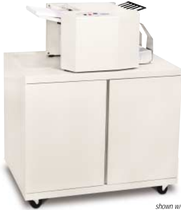
shown w/ optional cabinet

The FD 1500 is The low volume folder/sealer solution for processing one-piece pressure sensitive mailers. Built with proven technology, the FD 1500 provides an economical solution with the quality and reliability you have come to expect from American. The sleek office design and ease of operation makes this unit ideal for processing documents in an office environment with low volume applications. A processing speed of up to 85 forms per minute enables operators to complete daily processing jobs with ease. The added capability of processing 14" forms gives the FD 1500 the versatility needed to fold and seal virtually any low volume application to meet your needs.